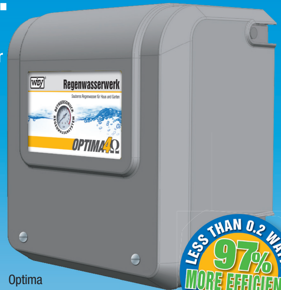
Optima with cover